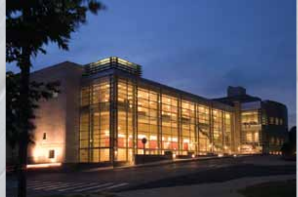
The Robert A. and Jan M. Beck Center at Cornell University

Cornell Hospitality Reports, Vol. 9, No. 16 (October 2009)